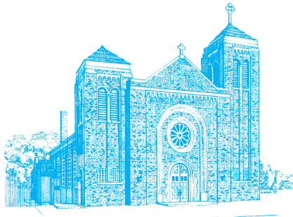
St. John Nepomuc